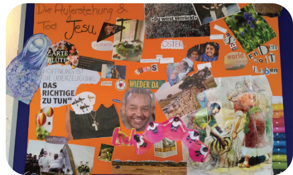
Resurrection collage made by the Confirmation Class.