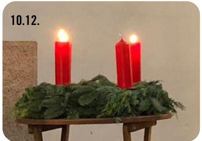
12pm Worship Service (2 nd Advent)