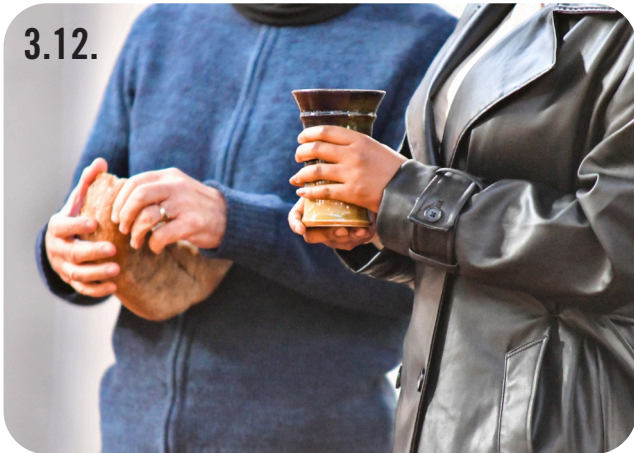
12pm Communion Service (1 st Advent)