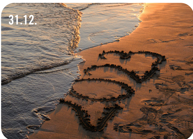
5pm Joint New Year's Eve Service