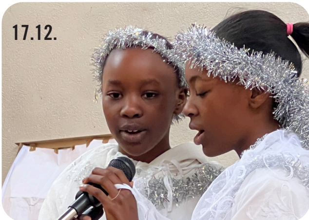
12pm Nativity Service (3 rd Advent)