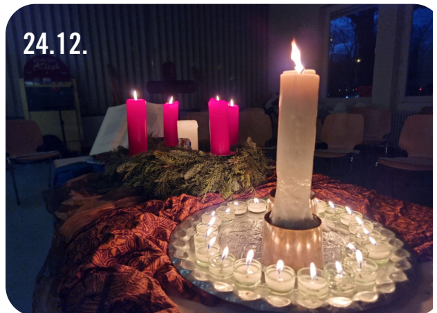
4pm Christmas Eve candle light service